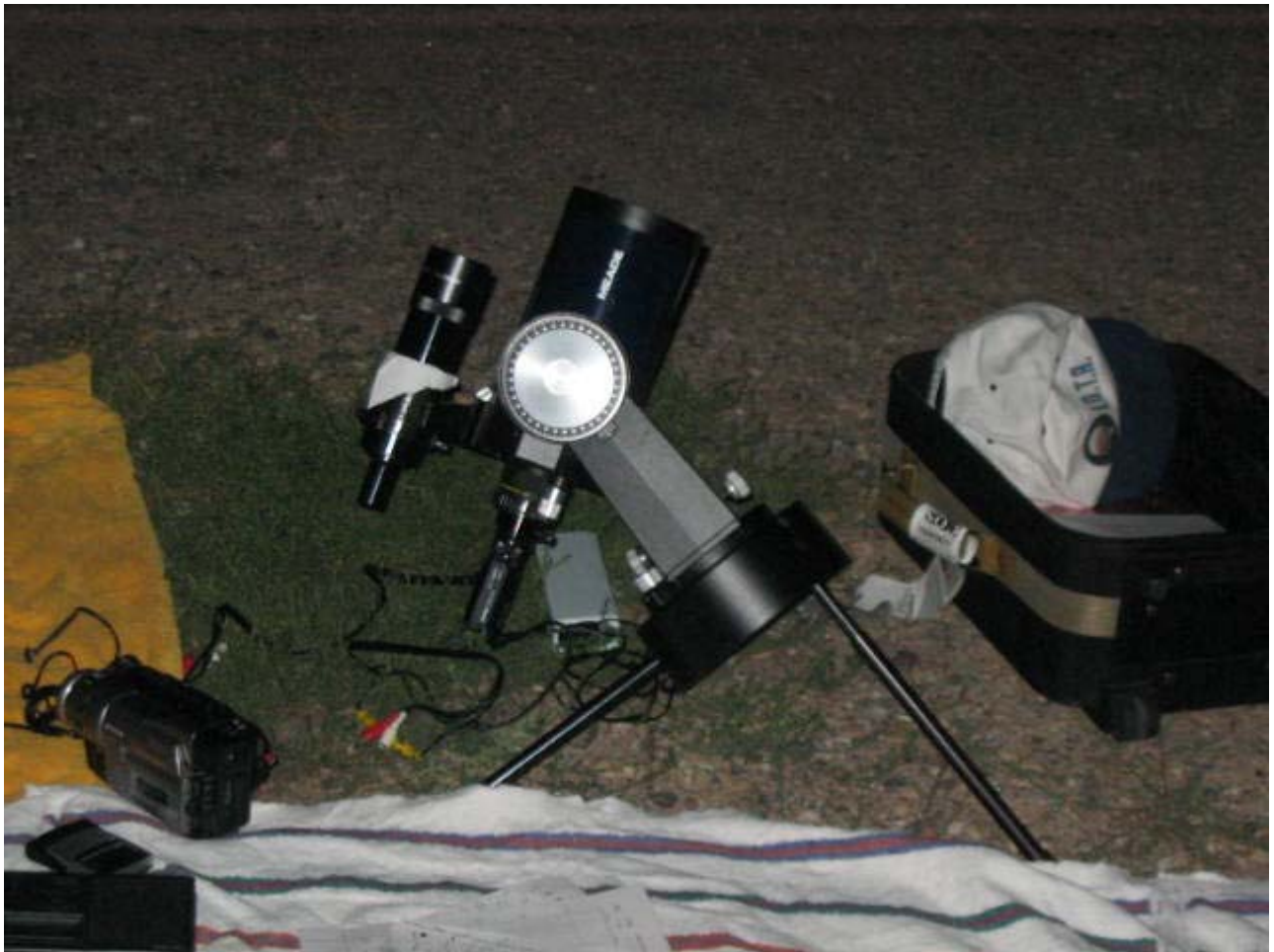
A Compact Video Occultation Observation System